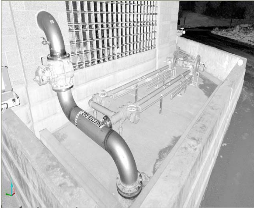
Scan data of piping at the regional waste water treatment plant in Durham, Oregon.